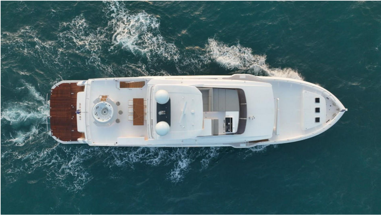
Aft Deck 1